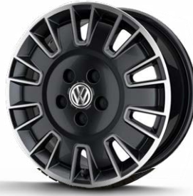
"Posada Black Diamond" alloy wheel 17" (Optional)