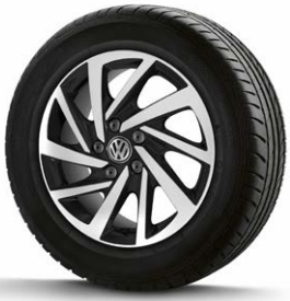
"Woodstock Black Diamond" alloy wheel 17" (Standard)