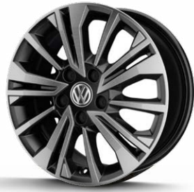
"Aracaju Black Diamond" alloy wheel 17" (Optional)